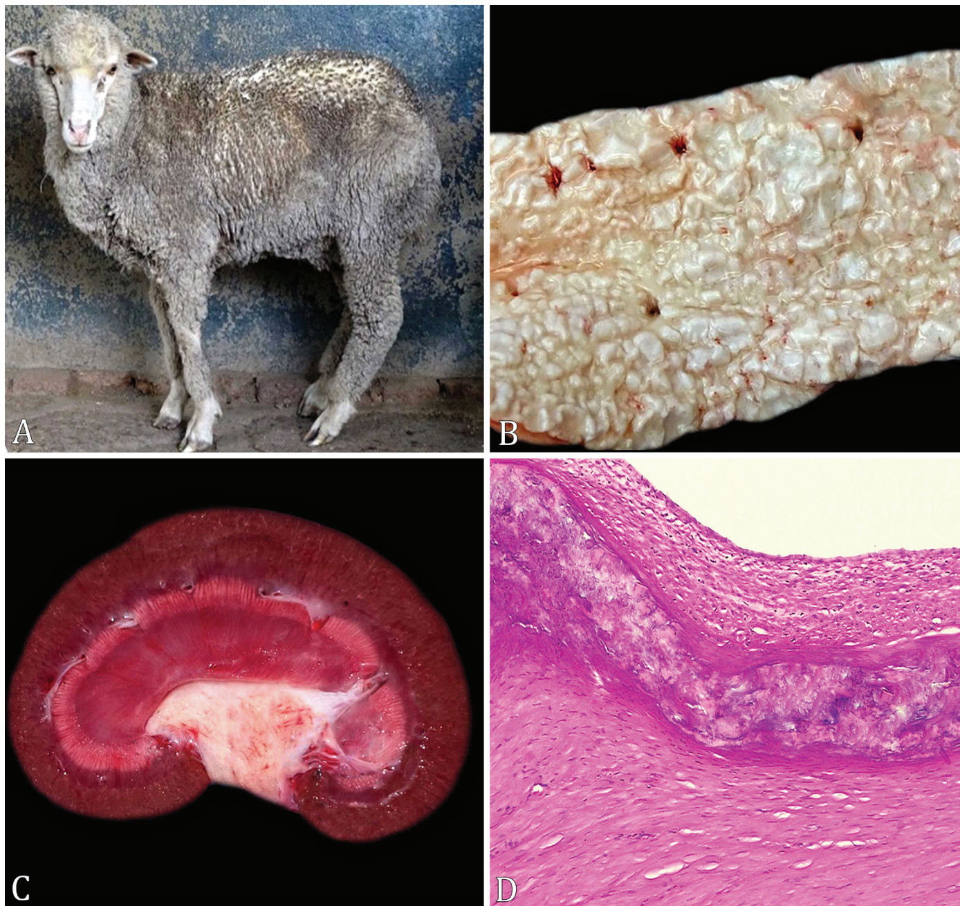
Fig.3. Enzootic calcinosis in sheep caused by Nierembergia rivularis in Uruguay. Outbreak B. (A) Sheep exhibiting kyphosis, retracted abdomen, poor body condition, and arched limbs. (B) Aorta. Diffusely irregular intimal surface with extensive calcified plates. (C) Kidney. Nephrocalcinosis characterized by white streaks radially arranged at the corticomedullary junction. (D) Carotid artery. Moderate intimal hyperplasia and tunica media calcification. HE, obj.10x.

Mild to marked calcification of the alveolar septa occasionally replaced the lung parenchyma with dense areas of calcification with bone and chondroid metaplasia. Calcification was also verified on renal tissues, affecting the distal tubular lumen, arterioles, and interstitium. Thyroid C-cell hyperplasia and carcinoma were observed in Sheep A (Machado et al. 2020). Sheep B showed thyroid C-cell hyperplasia and parathyroid chief cell atrophy. The parathyroid was not examined in Sheep A. In Sheep B, the cortical bones were moderately thickened,