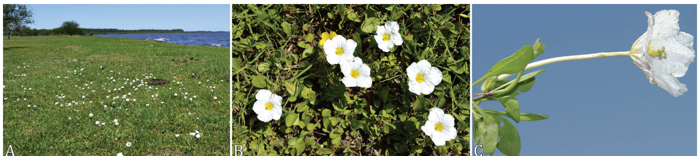
Fig.2. Location of outbreaks of enzootic calcinosis in sheep caused by Nierembergia rivularis in Uruguay. (A) Outbreak A. The border of the Rincon del Bonete lake is invaded by the plant. (B) Natural pasture invaded by Nierembergia rivularis . (C) Details of the flowering plant.

The cadavers were emaciated and showed widespread soft tissue calcification. Muscular and elastic arteries were diffusely rigid, with marked loss of elasticity. The intimal surface was irregular with multiple white, prominent, and multifocal-to-coalescing intramural plaques (Fig.3B). The bicuspid and semilunar aortic valves exhibited similar plaques that were also identified in the tendinous and endocardial cords. The lungs did not collapse and showed multifocal calcification, mainly in the caudal lobe. The kidneys exhibited whitish, opaque, linear, and radially arranged striations in the cortical and medullary region (Fig.3C). Marked thickening of