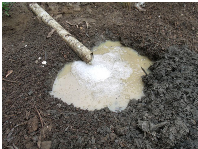
Fig.1. Cassava wastewater being discharged through a pipe to an unprotected area to which animals have access.

Manihot esculenta Crantz (cassava) is a cyanogenic plant which tuber roots are used to produce flour or starch. The processing of the tubers yield different by-products including wastewater, which is the liquid pressed out of the tuber after it has been mechanically crushed (Cereda 2001). In Brazil, cassava wastewater has been used as animal food (Almeida et al. 2009). It is also recommended as fertilizer (Ferreira et al. 2001). However, in most cases, the wastewater is disposed into the environment causing pollution or animal poisoning (Fig.1). In a recent study carried out by our research group, cassava wastewater was mentioned by 27 out of 67 farmers as the main cause of animal poisoning in the region and affected cattle, sheep, donkeys, pigs, and chicken (Pinheiro et al. 2013). Usually, poisoning occurs when the wastewater is discharged through pipes or channels to containers or areas to which animals have free access. The cassava varieties used in northeastern Brazil for flour production are the bitter varieties with roots containing 0.02-0.03% HCN (DM basis) (Murugesrawi et al. 2006). The cyanogenic glycosides contained in cassava are linamarin (approx. 95%) and lotaustralin (5%). Through processing, linamarase comes in contact with cyanogenic glycosides and catalyzes the hydrolysis to glucose and cyano-