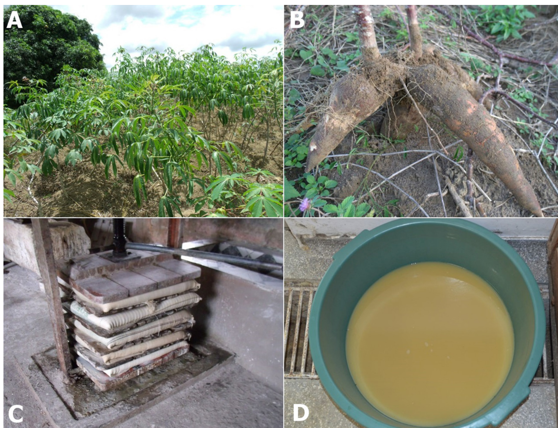
Fig.2. (A) Plants of Manihot esculenta . (B) M. esculenta tubercles. (C) Mash prepared from cassava tubercles conditioned into bags to be pressed. (D) Cassava wastewater used in the experiment, which was obtained from pressing the cassava mash.

were weighed and fasted for 12 hours with water ad libitum . The animals were examined 10 minutes before and 10 minutes after the administration of wastewater for determination of heart and respiratory rates, rectal temperature, and ruminal movements.