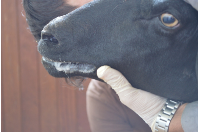
Fig.4. Experimental poisoning by cassava wastewater. Sheep 3 exhibited salivation and dilated nostrils 15 minutes after the ingestion of 0.99 \text{ mg HCN kg}^{-1} \text{ BW} .

ep 1, 2, and 3 showed severe signs including tachycardia, tachypnea, dilated pupils, drooling, dilated nostrils (Fig.4), engorged episcleral vessels, ataxia, weakness (Fig.5), muscle tremors, ruminal atony and bloat. Sheep 4 and 5, which ingested 0.63 \text{ mg HCN kg}^{-1} and 0.5 \text{ mg HCN kg}^{-1} , showed mild clinical signs that included ruminal hypomotility, dilated nostrils, tachycardia, and tachypnea. The five sheep recovered in 10-40 minutes after thiosulfate treatment. On the second day of experiment, only sheep 1 and 2 exhibited clinical signs of tachycardia and tachypnea. Sheep 1 exhibited mild muscle tremors. Sheep 1 and 2 recovered 20 and 17 minutes after application of 20% sodium thiosulfate, res-