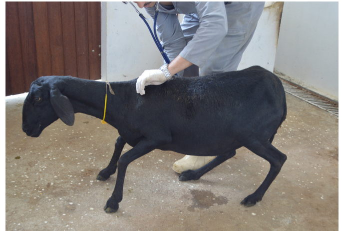
Fig.5. Experimental poisoning by cassava wastewater. Sheep 3 exhibited respiratory distress and flexion (weakness) of the four limbs, 16 minutes after the ingestion of 0.99 \text{ mg HCN kg}^{-1} \text{ BW} .

c Control, A first administration, B second administration.