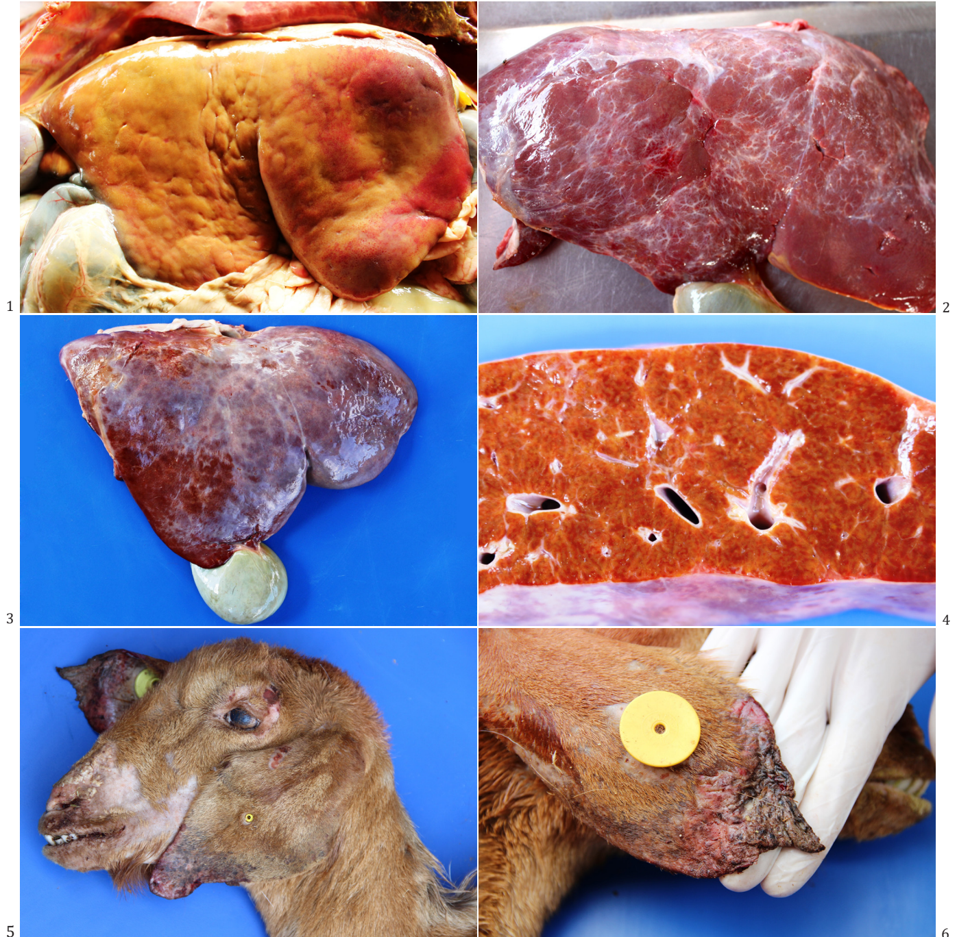
Fig.1. Liver increased in size, diffusely yellowish with irregular surface in Goat 6, succumbed from Brachiaria decumbens poisoning.

(Fig.4). Cutaneous lesions, previously described, were observed in three cases (Fig.5 and 6). In the three goats that developed respiratory signs was observed right unilateral suppurative bronchopneumonia characterized by blackening and consolidation of the parenchyma mainly in right cranial lobe