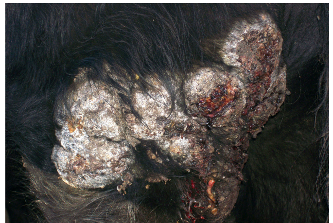
Fig.2. Higher magnification of the lesion in the left hind limb of Bull B.