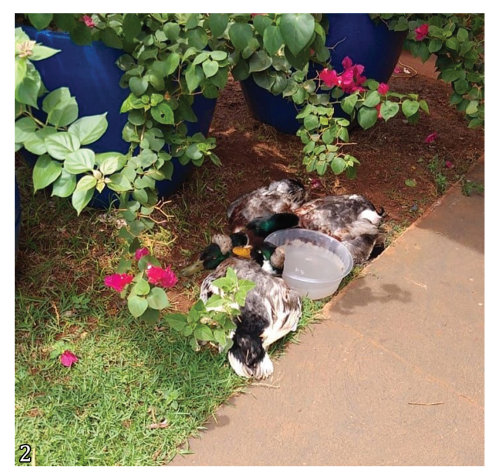
Fig. 2. Three birds, from Parque da Liberdade, showing clinical signs of flaccid paralysis.

The samples (liver, stomach content, intestinal content, and serum) collected from the two teals and the water samples were processed and analyzed for botulinum toxin through the standard bioassay technique in mice at the Laboratory of Bacteriology at the "Escolha de Veterinária e Zootecnia" (School of Veterinary and Animal Science) at the "Universidade Federal de Goiás" (UFG). Samples were inoculated (0.5mL) intraperitoneally into mice with body weights ranging from 20 to 25 grams, according to the procedures described by Smith (1977). Meanwhile, specimens from the same samples were heated at 85°C for 20 minutes and inoculated into additional