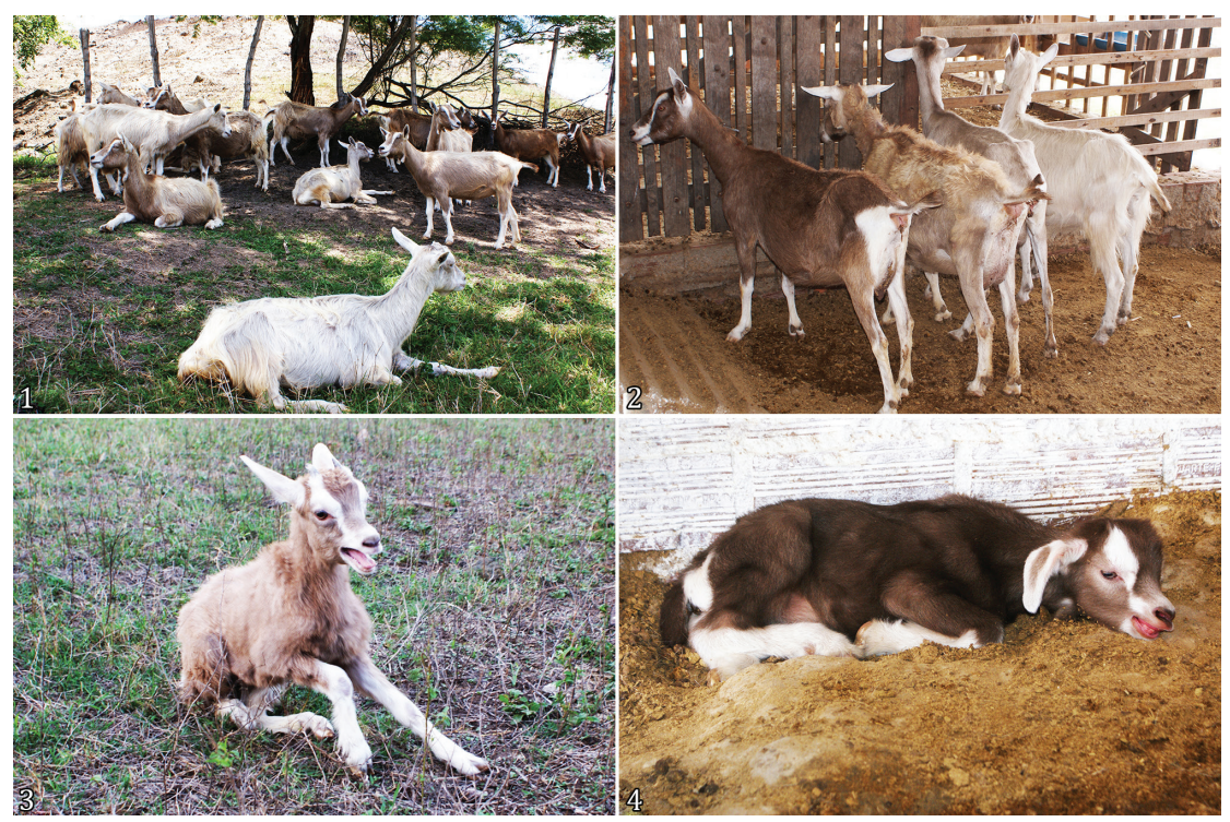
Fig.1-4. Copper deficiency in dairy goats and kids. (1 and 2) Herd of dairy goats exhibiting different levels of achromotrichia. (2) From the left to the right, a normal dairy goat with dark brown fur, and moderate to severe cases of achromotrichia with dairy goats presenting fur discoloration reaching to white. (3) Kid with hindlimb paraparesis in a case of late ataxia. (4) Permanent recumbency due to inability to stand up in a case of neonatal ataxia.